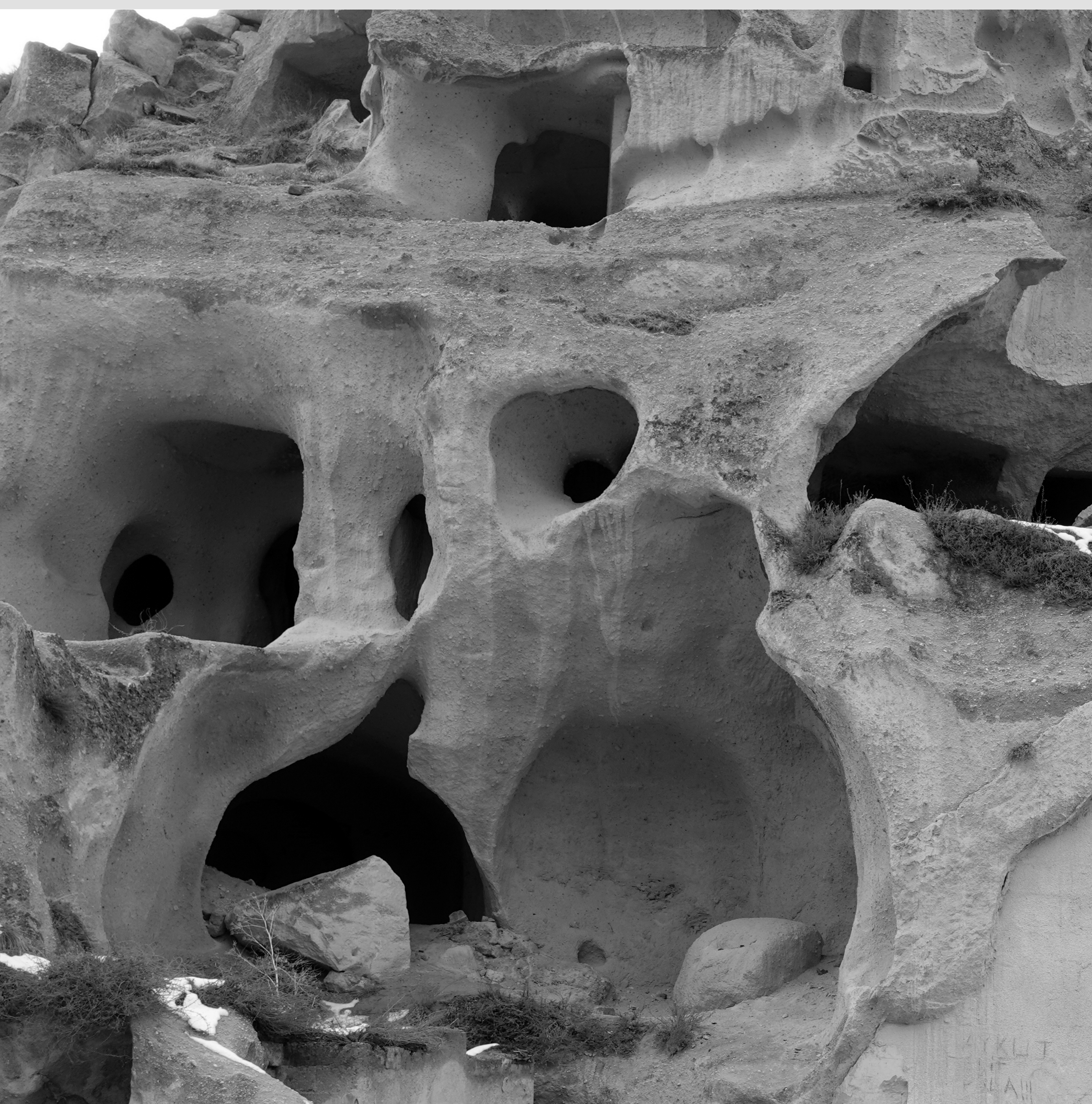
Living in Cappadocia.

After an overview of the presenter's previously published work on the relation between migration and architecture, this lecture will explore the right-to-heal after massive mass migrations during nation-state formations as a topic of transitional justice. It will concentrate on the dissolution of the Ottoman Empire, including the "Exchange of Populations" treaty (1923) that divided the communities residing in thousands of villages and towns into two purified categories between Greece and Turkey, assuming the alignment of religion, nation and territory, regardless of the actual diversity of peoples, and whether there were hostile or peaceful relations on the ground. The lecture will expose the contrast between the declarations of state agents and international law diplomats on the one hand, and the experiences of those involved on both sides of the Aegean Sea on the other hand. It will discuss the residues of this historical wound today, by studying the practice of a handful of architects, residents and stonemasons as a struggle toward healing through architecture.