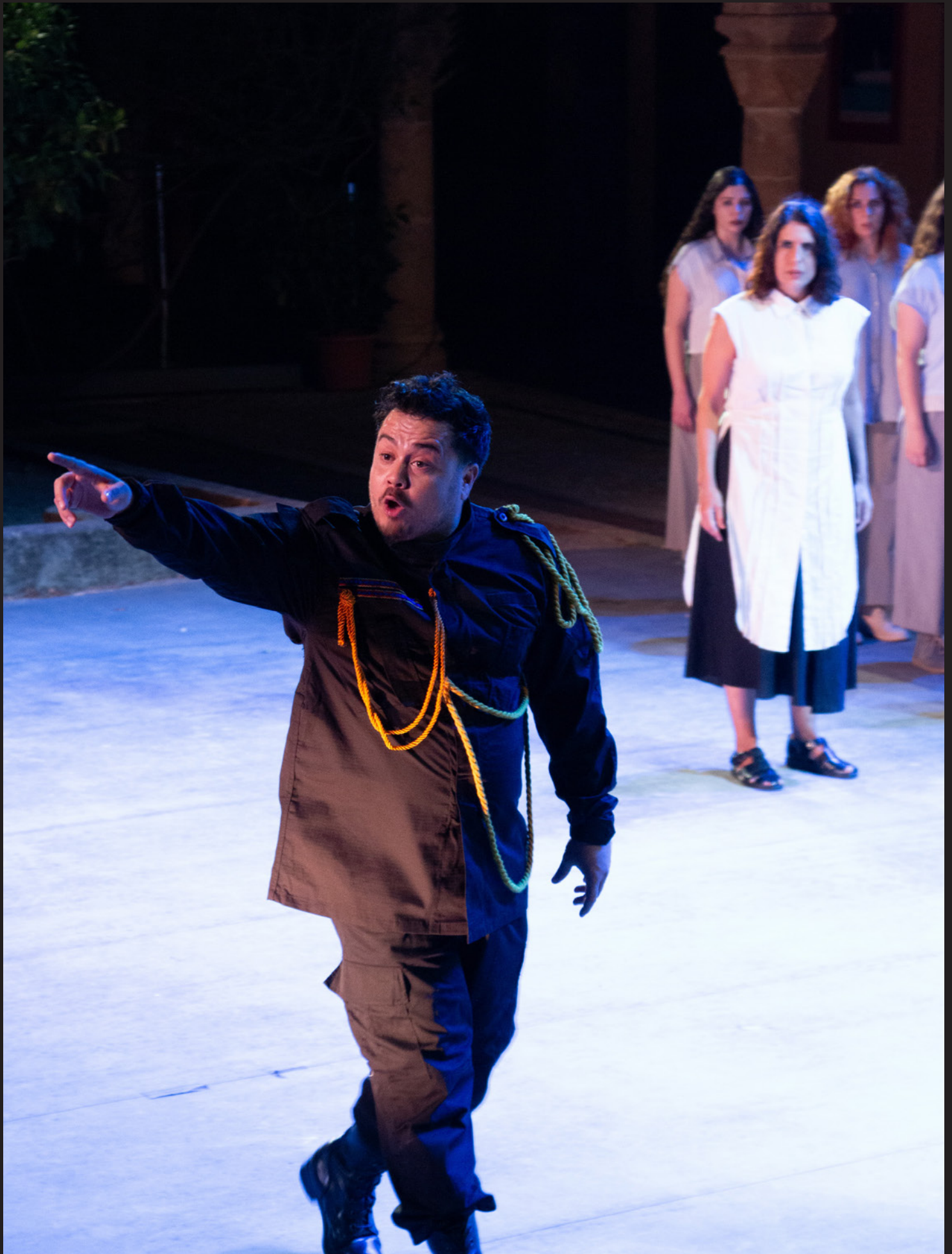
The Phoenician Women by Euripides at the Axiothea Mansion.