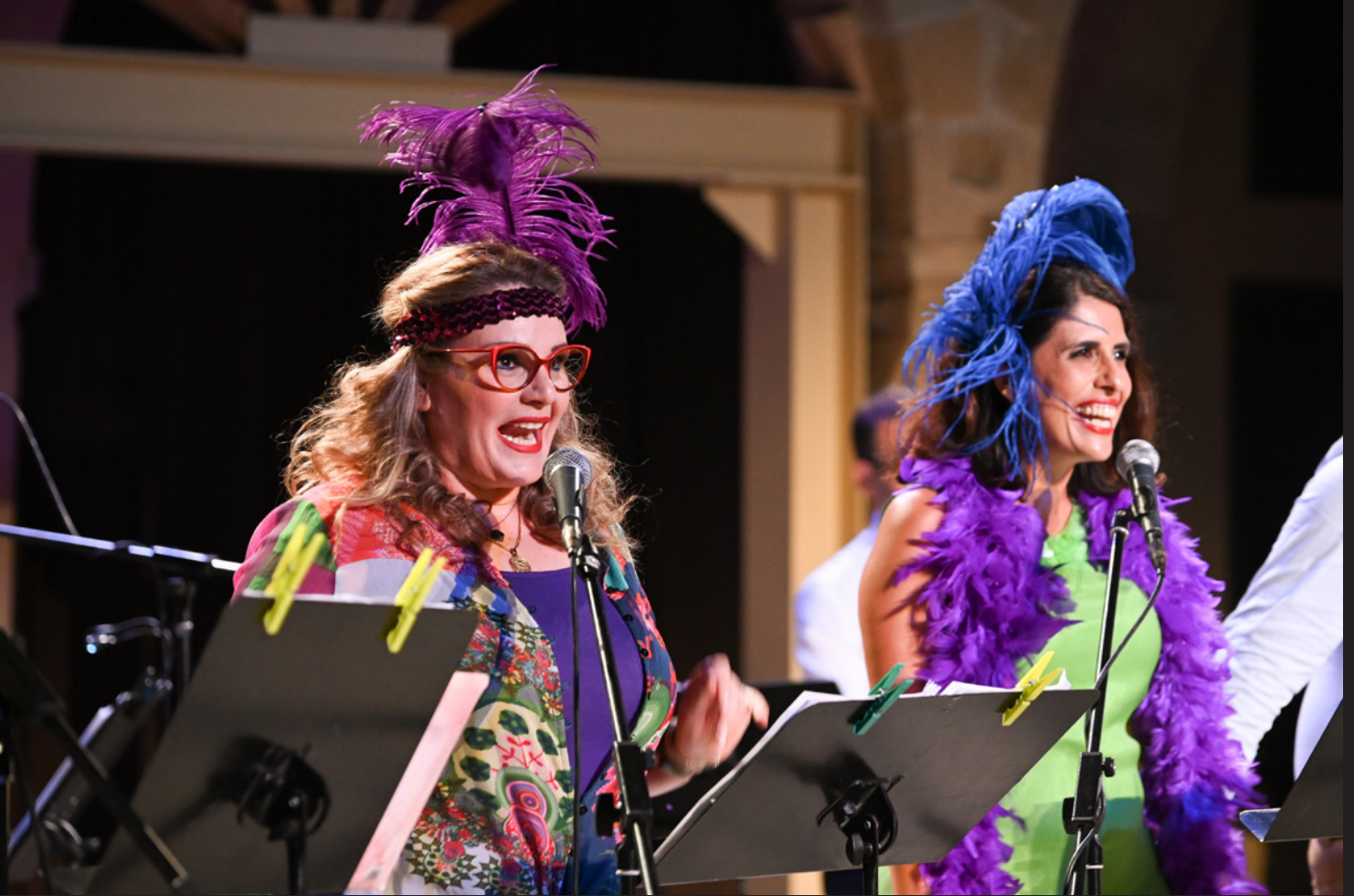
Ulysses by James Joyce, excerpts from the chapter "Circe", at the Axiothea Mansion.