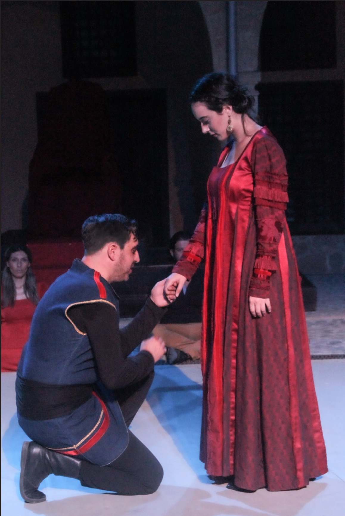
Erotokritos by Vitsentzos Cornaros at the Axiothea Mansion.