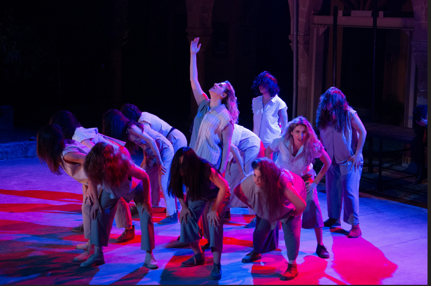
The Phoenician Women by Euripides at the Axiothea Mansion.