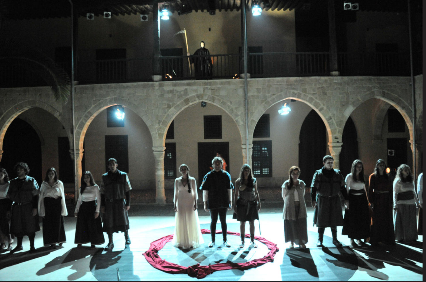
Digenis Akritas at the Axiothea Mansion.