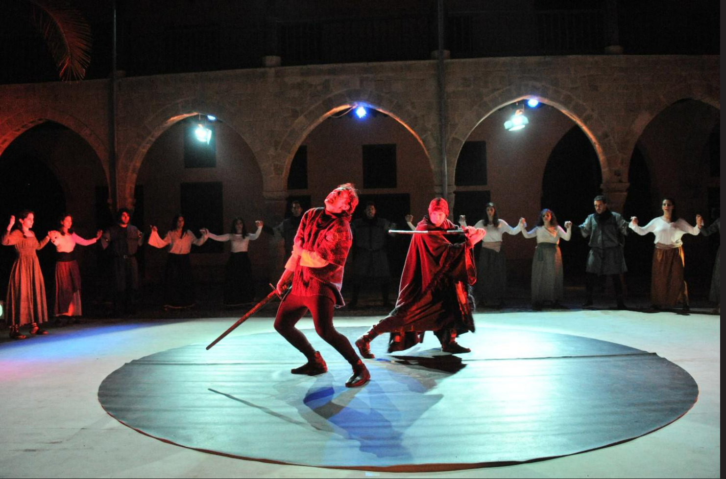
Digenis Akritas at the Axiothea Mansion.