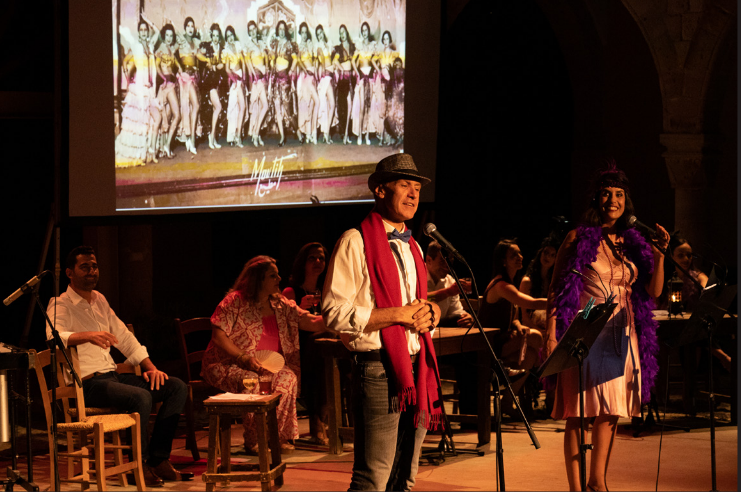
Always Alexandria remains herself, at the Axiothea Mansion.