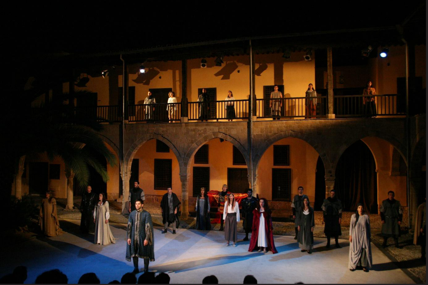
The Chronicle of Cyprus by Leontios Machairas at the Axiothea Mansion.