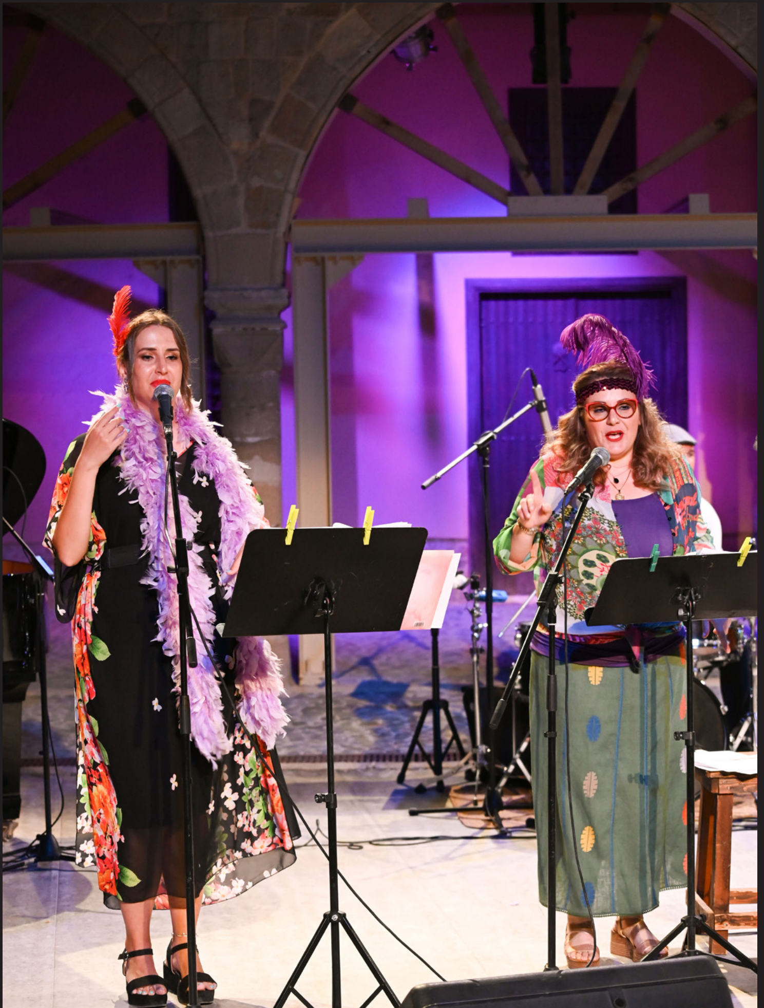
Ulysses by James Joyce, excerpts from the chapter "Circe", at the Axiothea Mansion.