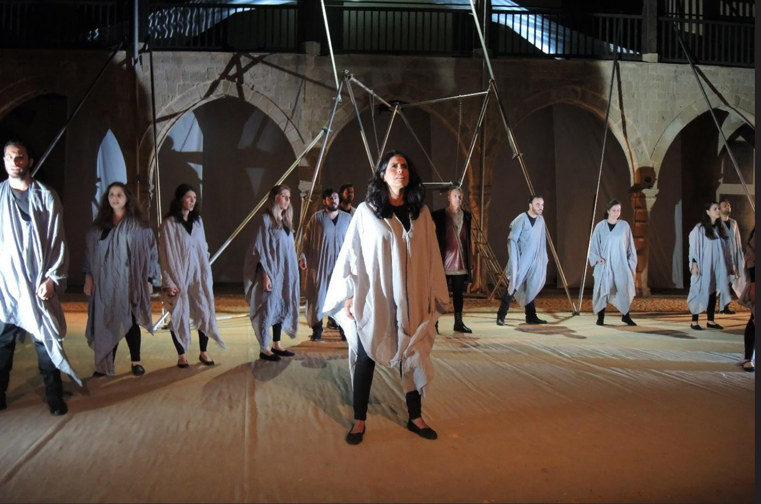
Ecce Luminae: Prometheus Bound by Christodoulos Galatopoulos.