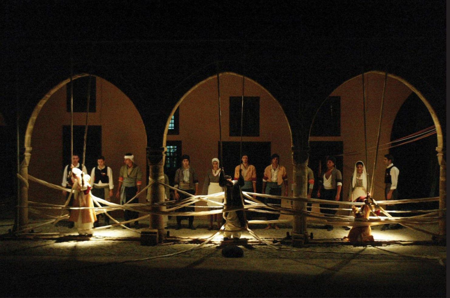
The Ballad of the Bridge at the Axiothea Mansion.