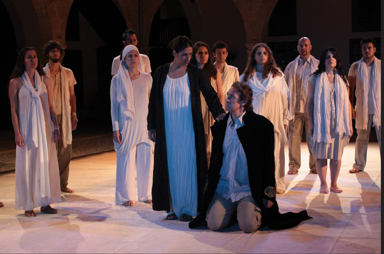
Waters of Cyprus, of Syria, and of Egypt. Study on the 'Dramatic' Cavafy.