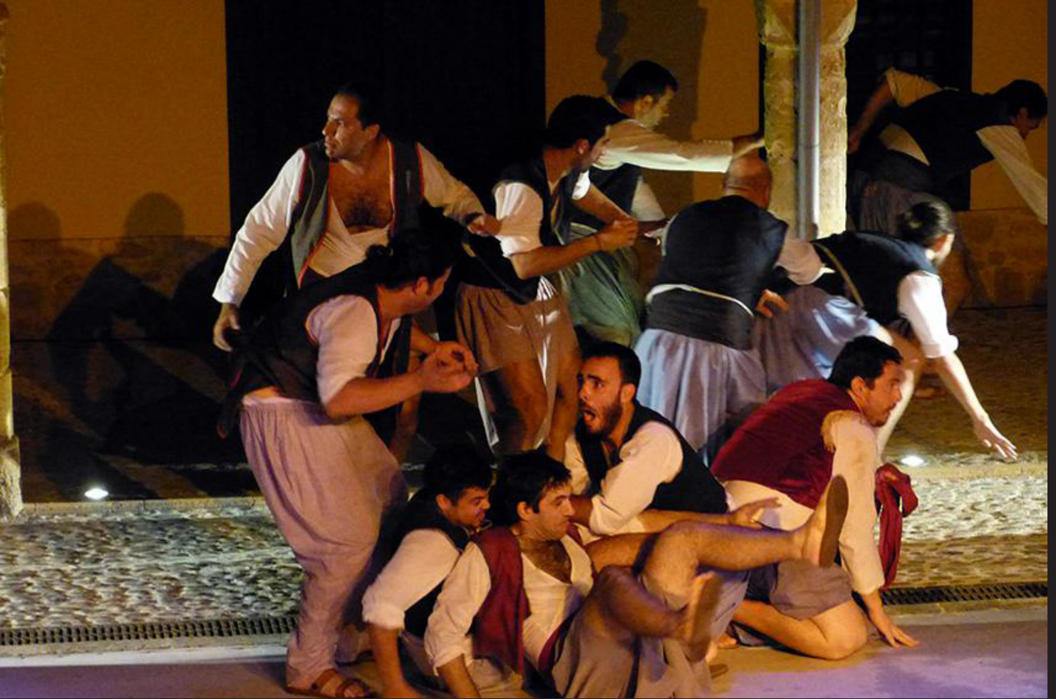
Performance of Aristophanes' Lysistrata translated into Cypriot dialect by Costas Montis at the Axiothea Mansion.