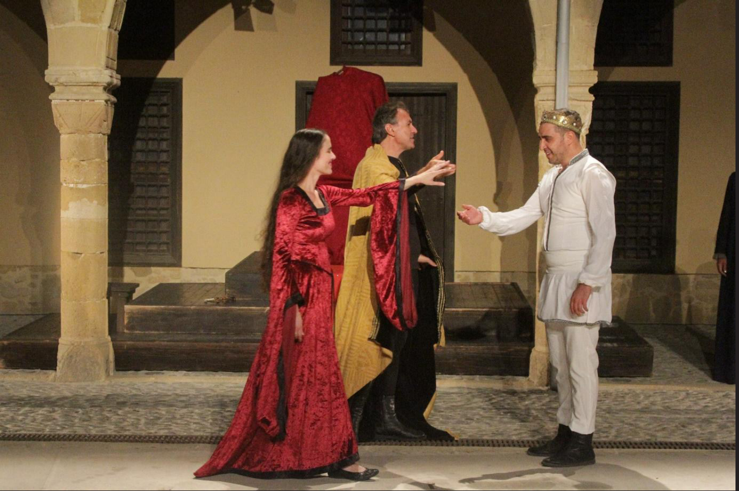
Erotokritos by Vitsentzos Cornaros at the Axiothea Mansion.