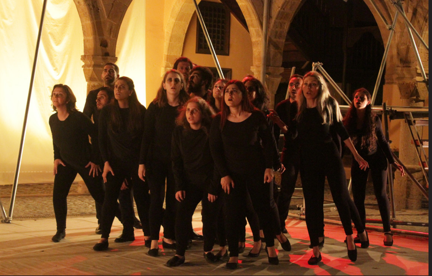
Ecce Luminae: Prometheus Bound by Christodoulos Galatopoulos.