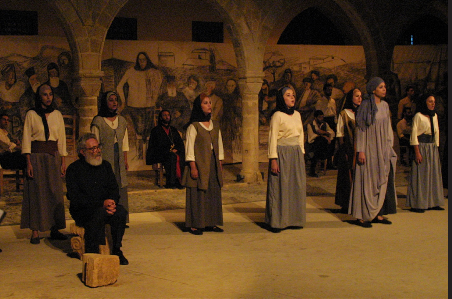
Performance of Romiosyni by Vasilis Michaelidis at the Axiothea Mansion.