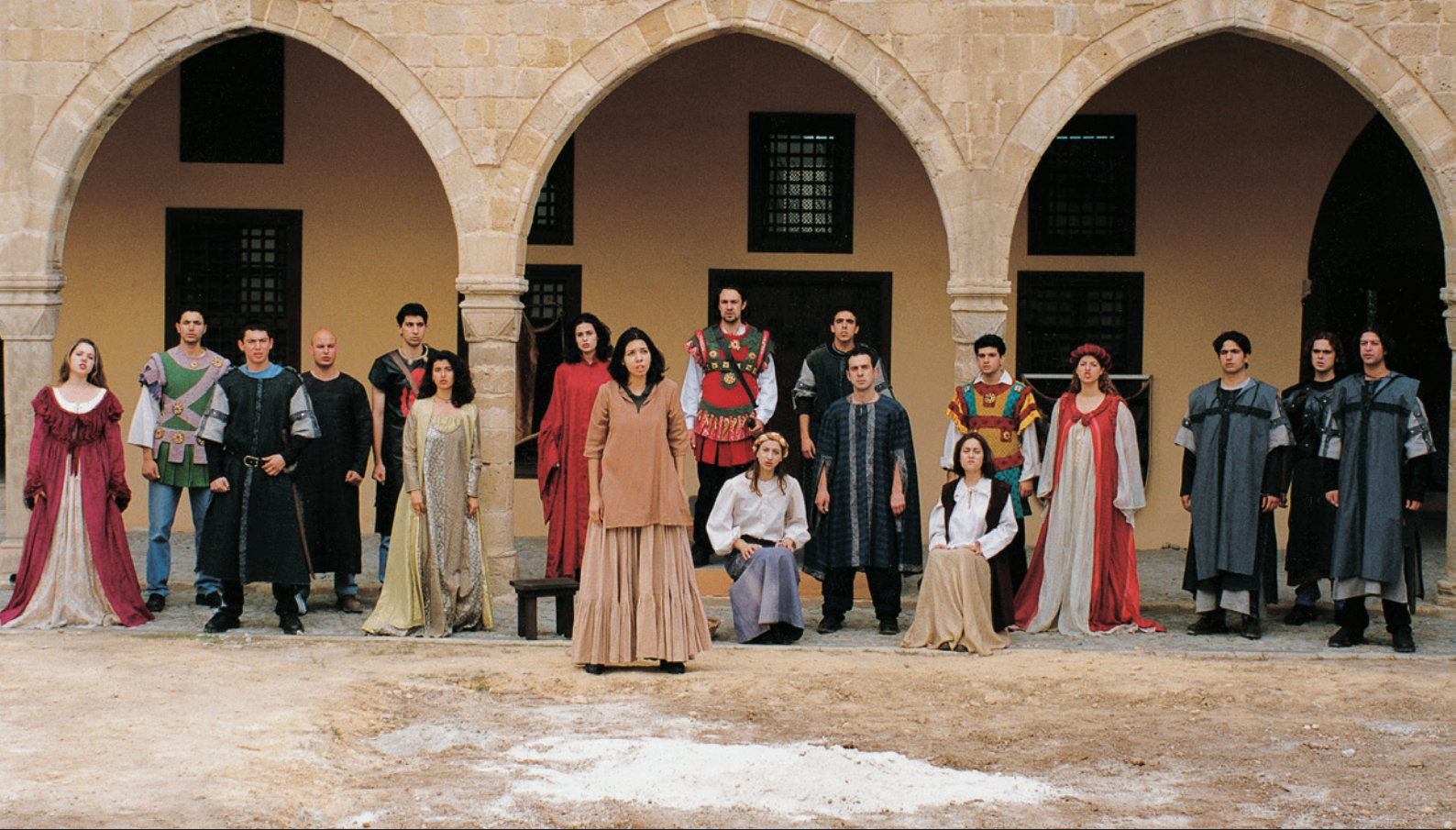
The Chronicle of Cyprus by Leontios Machairas at the Axiothea Mansion.