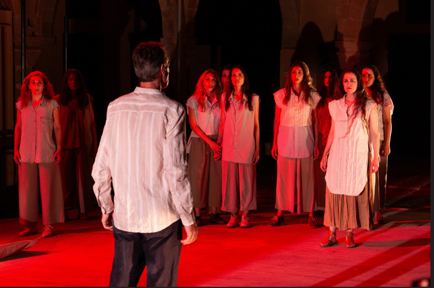
The Phoenician Women by Euripides at the Axiothea Mansion.