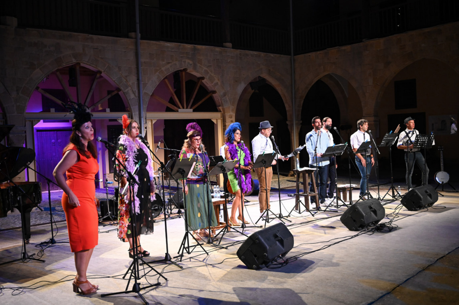
Ulysses by James Joyce, excerpts from the chapter "Circe", at the Axiothea Mansion.