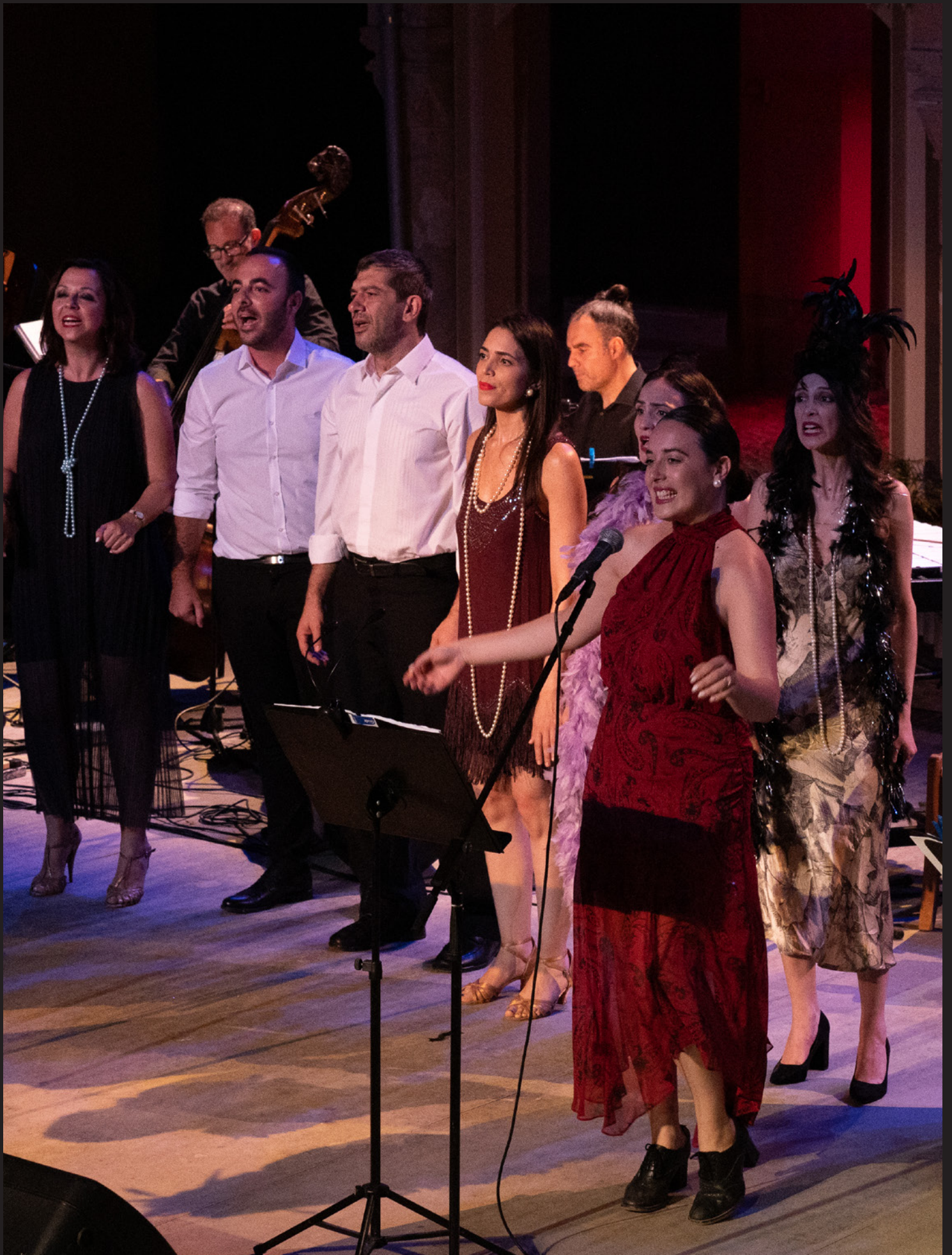
Always Alexandria remains herself, at the Axiothea Mansion.