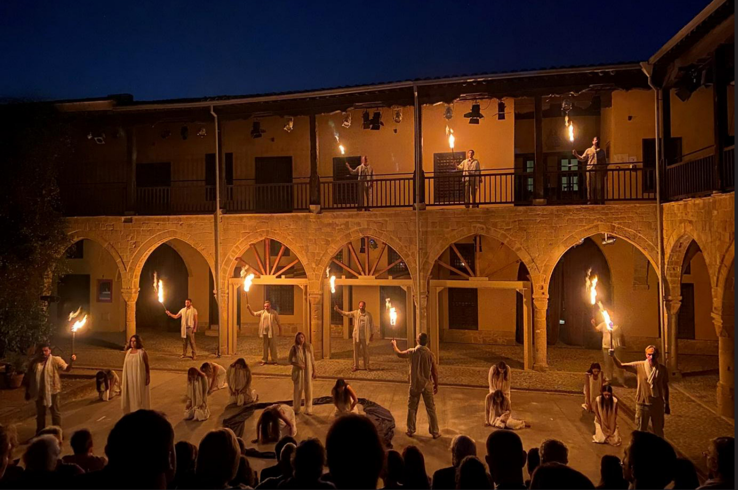
Waters of Cyprus, of Syria, and of Egypt. Study on the 'Dramatic' Cavafy.