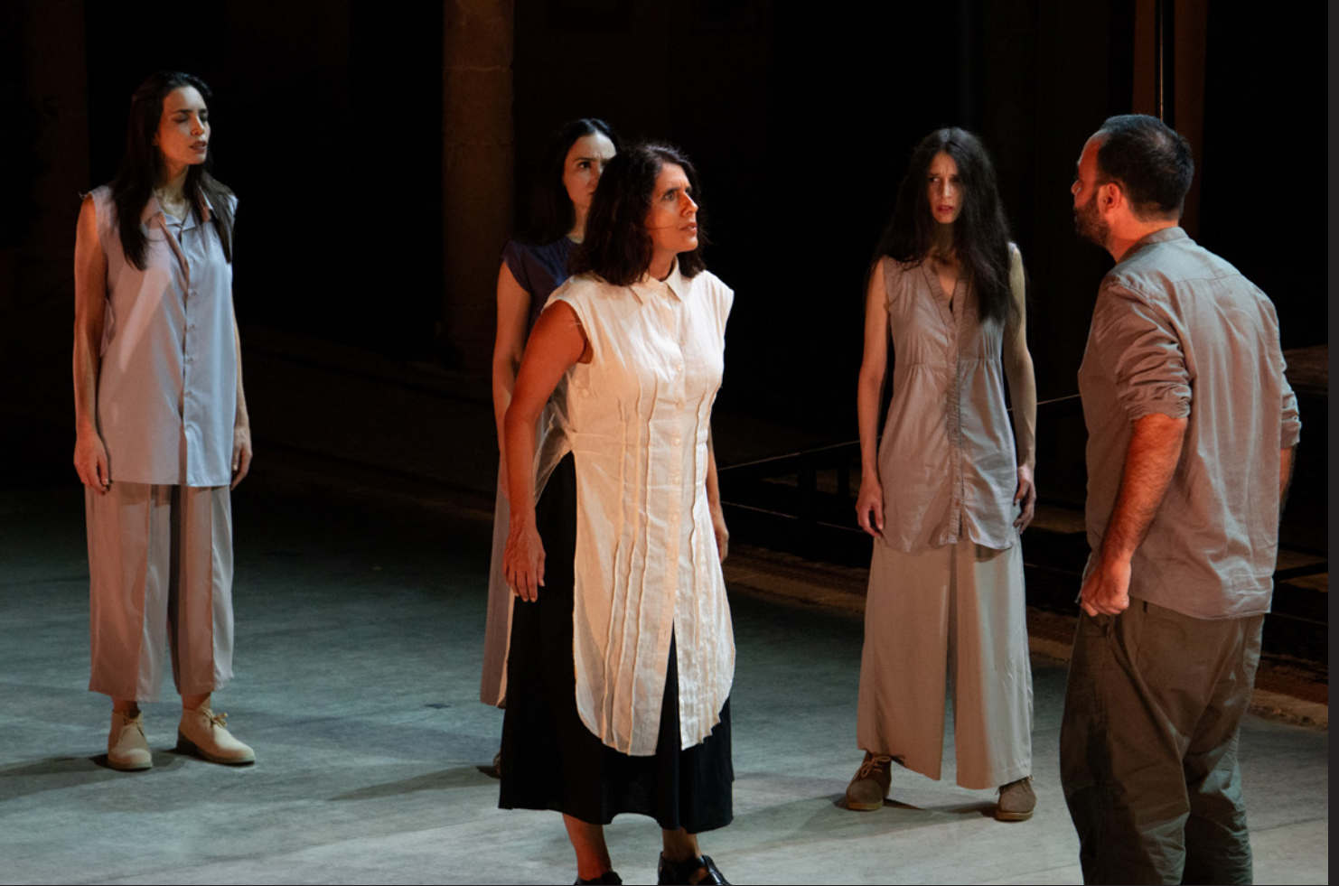
The Phoenician Women by Euripides at the Axiothea Mansion.