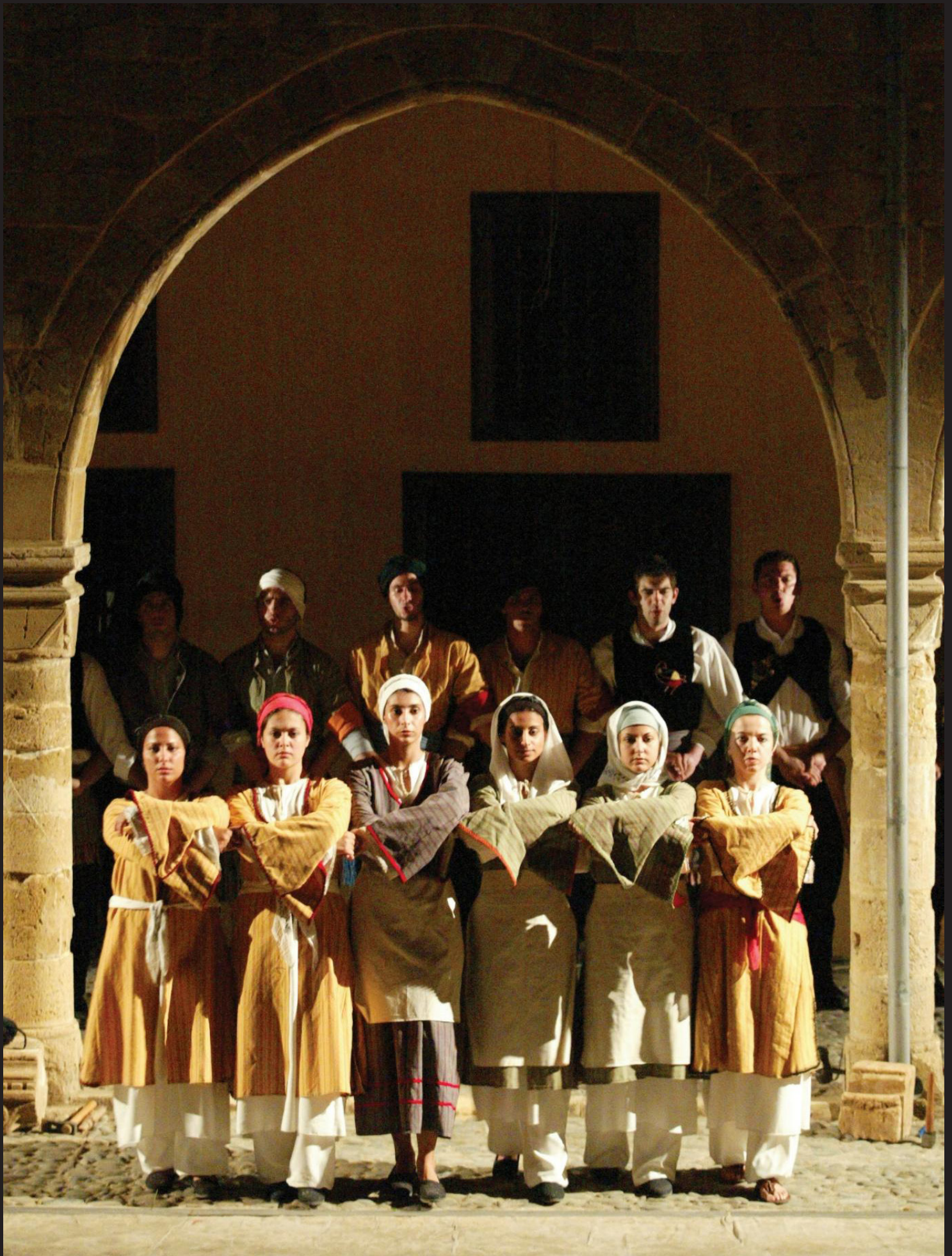
The Ballad of the Bridge at the Axiothea Mansion.