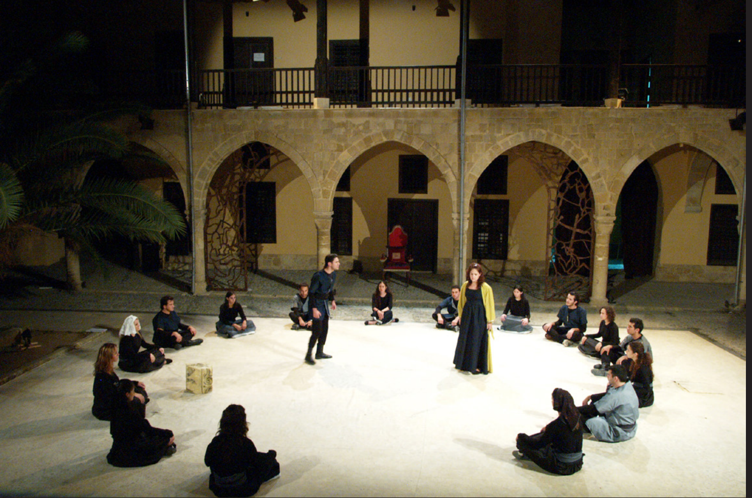
Erotokritos by Vitsentzos Cornaros at the Axiothea Mansion.