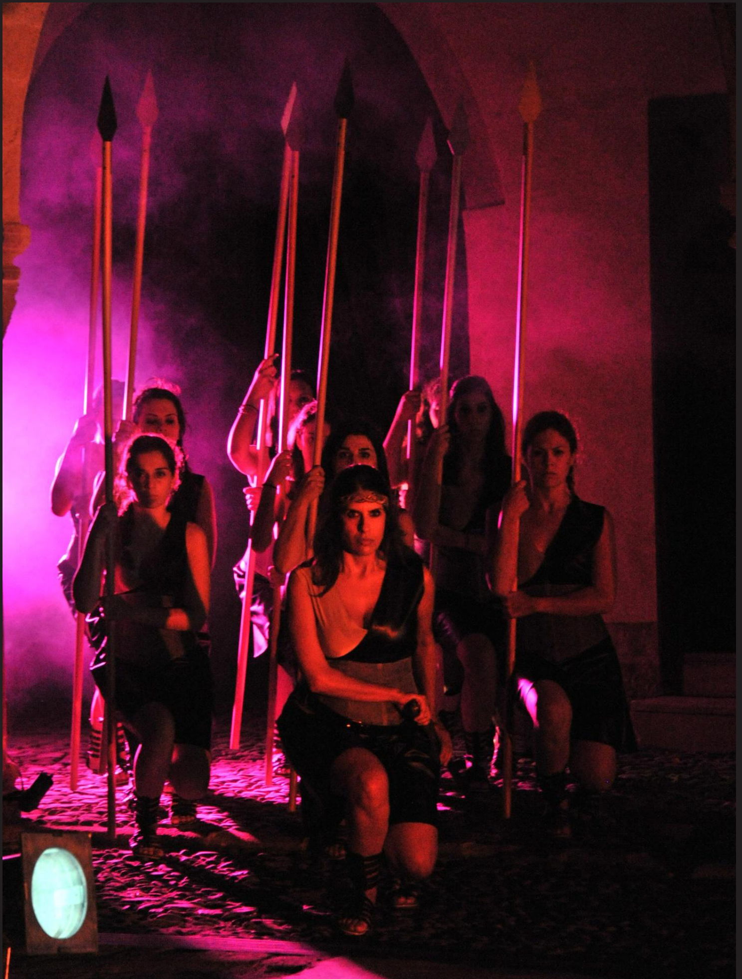
Digenis Akritas at the Axiothea Mansion.