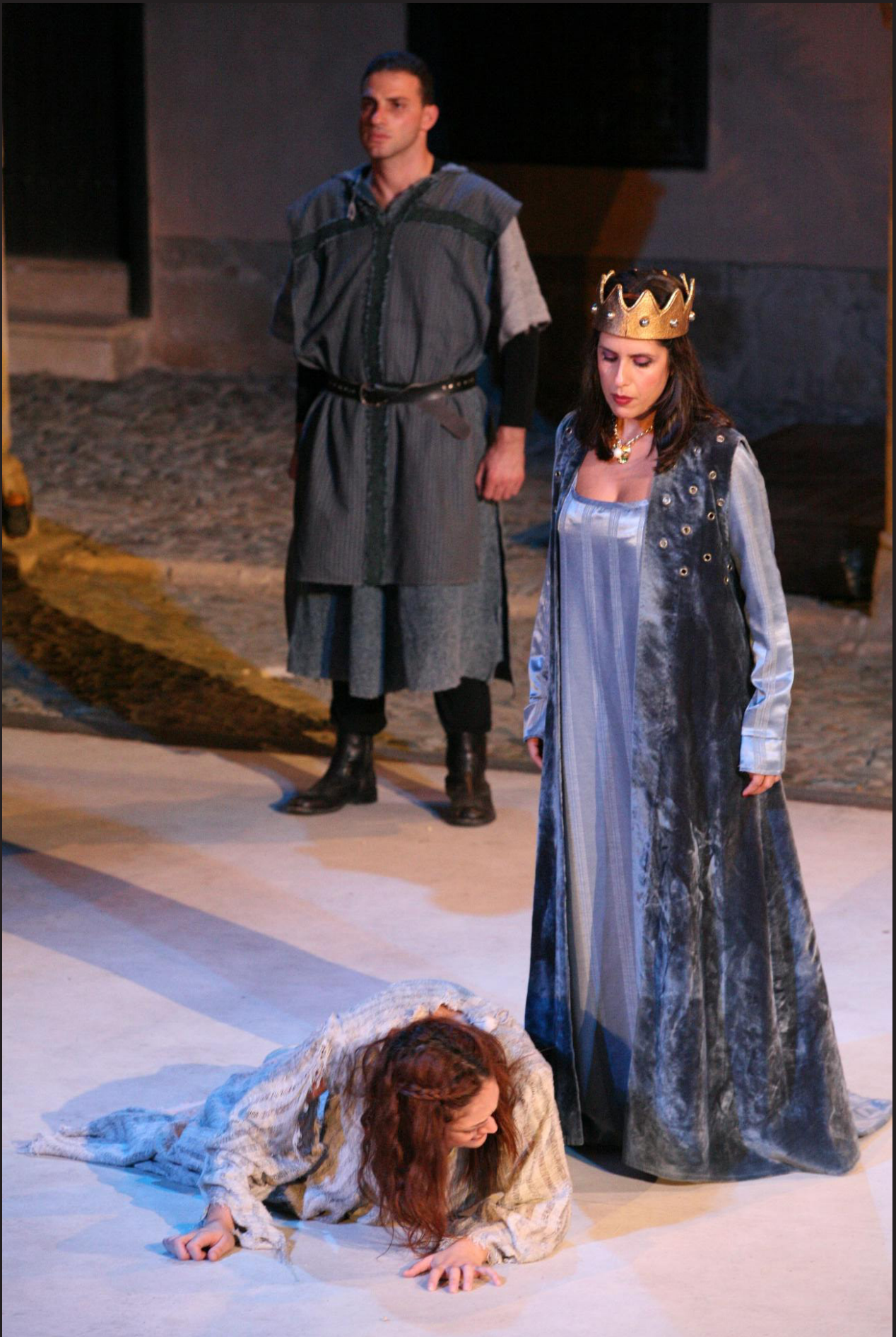
The Chronicle of Cyprus by Leontios Machairas at the Axiothea Mansion.