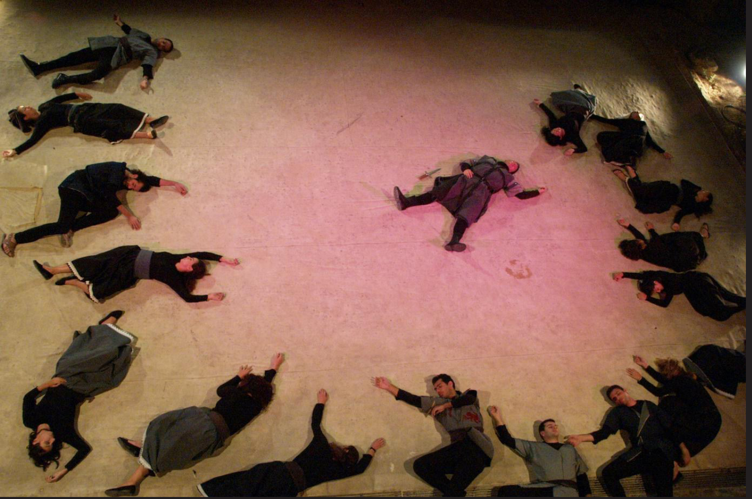
Erotokritos by Vitsentzos Cornaros at the Axiothea Mansion.