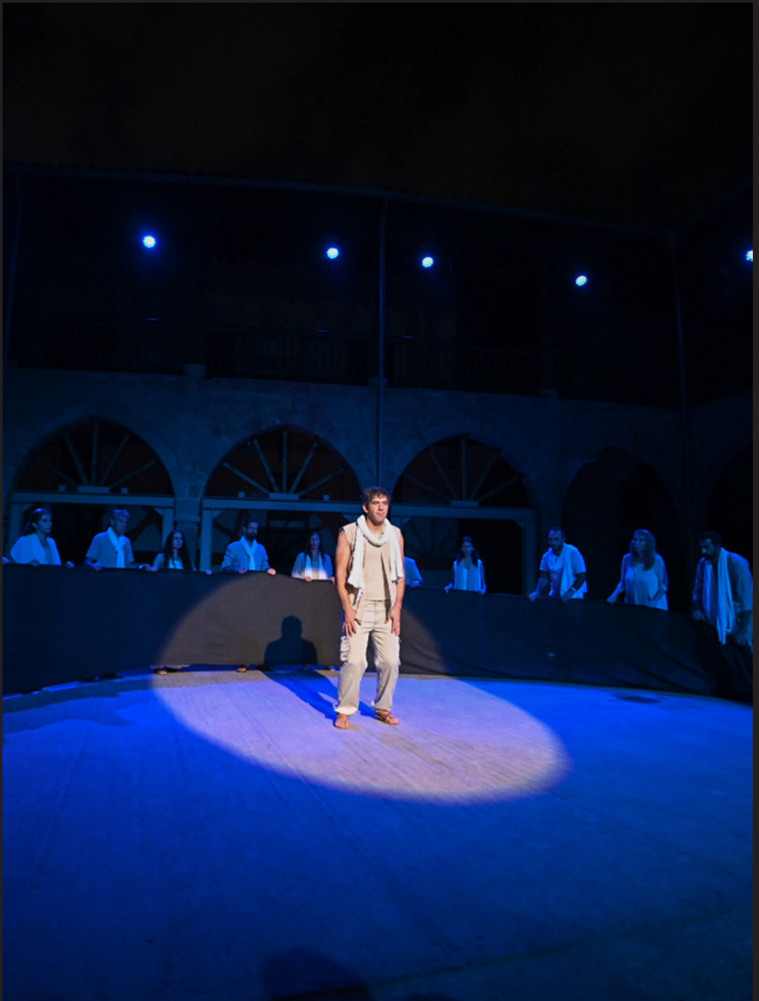
Waters of Cyprus, of Syria, and of Egypt. Study on the 'Dramatic' Cavafy.