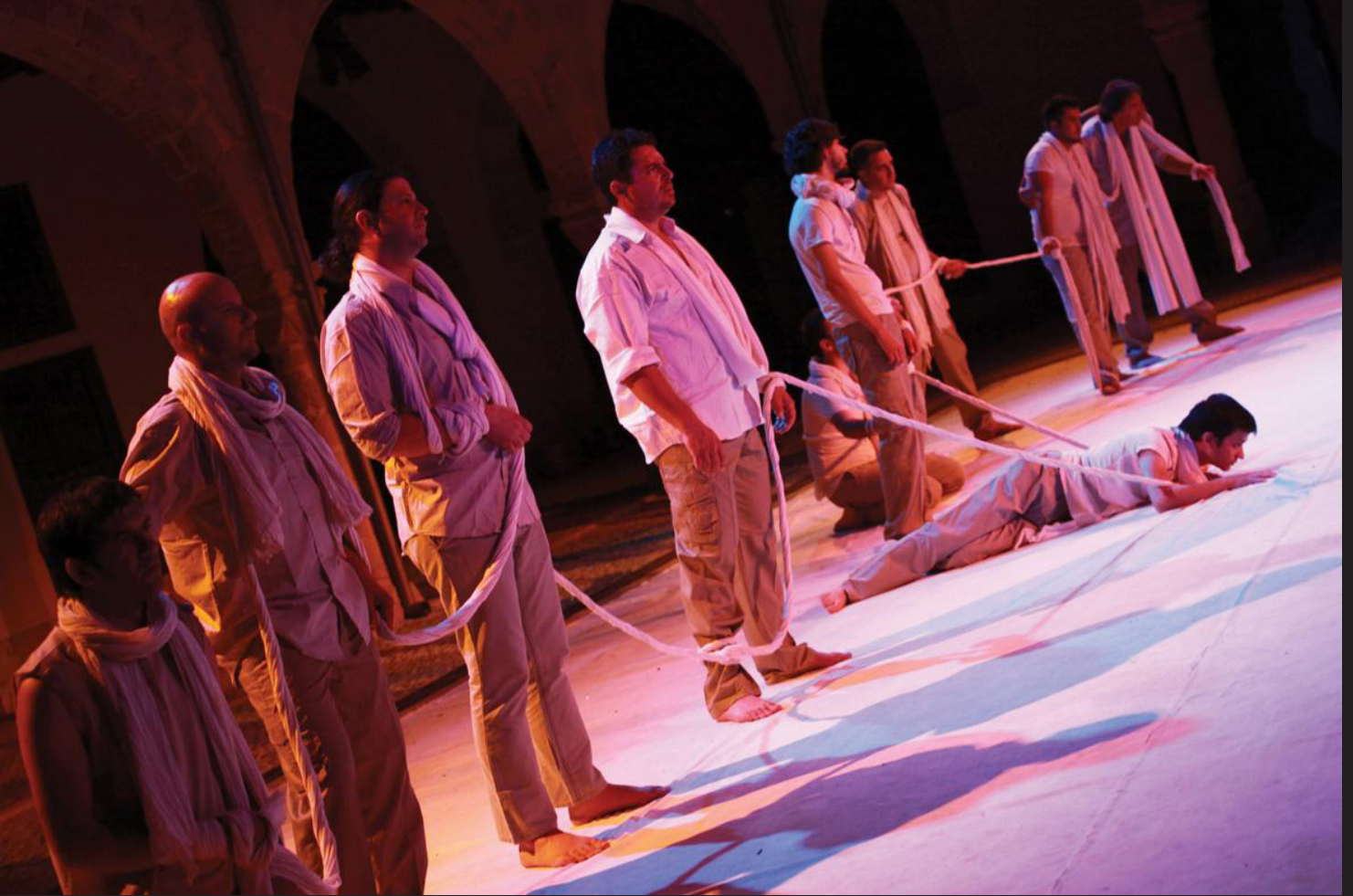
Waters of Cyprus, of Syria, and of Egypt. Study on the 'Dramatic' Cavafy.