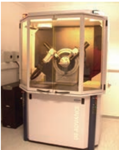
University of Cyprus has a fully equipped geophysics laboratory, including this X-ray diffraction unit.

The University of Cyprus (UCY) was formed in 1989 and admitted its first class in 1992. It is based in Nicosia, the capital city of Cyprus. UCY only