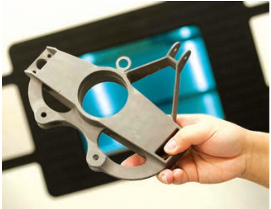
This geometrically complex component was created using additive manufacturing.

The process is probably more familiar to the general public as a type of 3D printing. Instead of filling a mold with molten plastic or metal, or subtracting a refined shape from a larger block of material, 3D printing makes 3D solid objects from a digital model. Additive manufacturing creates an object by laying down successive layers of material. One approach to 3D printing uses a laser to sinter granular material