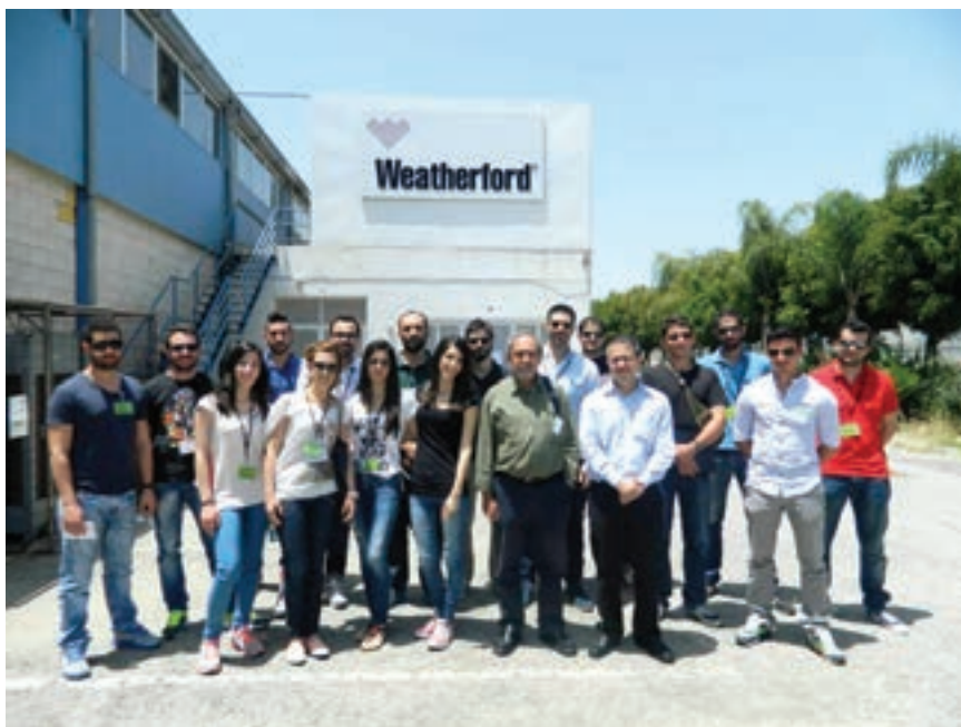
The university's SPE student chapter visits Weatherford's screen manufacturing plant in Cyprus.

area. The university's Department of Mechanical Engineering has also started work on rheology studies, which will serve as a foundation for future drilling fluids projects.