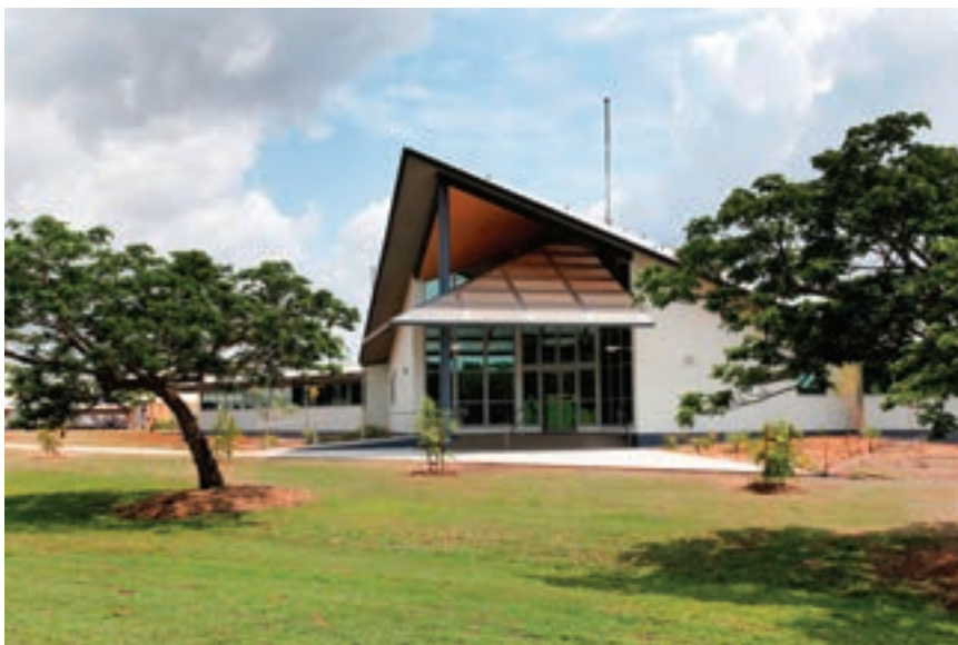
The Northern Australian Centre for Oil and Gas (NACOG) was established at Charles Darwin University in November 2012.