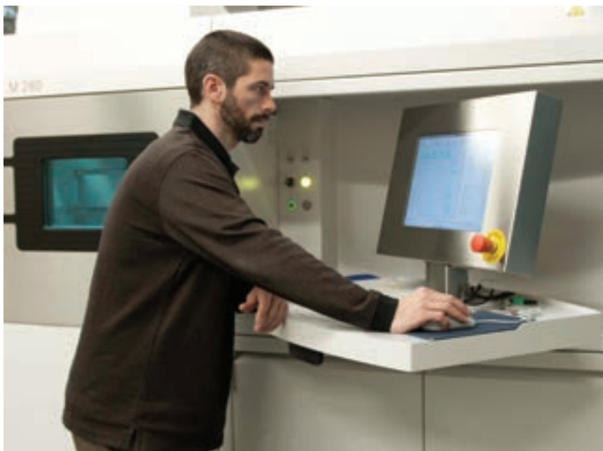
A research engineer programs an additive manufacturing system at the Applied Research Laboratory at Penn State University.

Penn State has taught petroleum-related classes since 1896 and today has an active upstream research program including studies on such topics as fluid dynamics, reservoir engineering, and improved oil and gas recovery. In addition, Penn State's College of Earth and Mineral Sciences established the Institute for Natural Gas Research in 2013, and several Penn State colleges fund the Penn State Marcellus Center for Outreach and Research, the university's education and research initiative on unconventional gas plays.