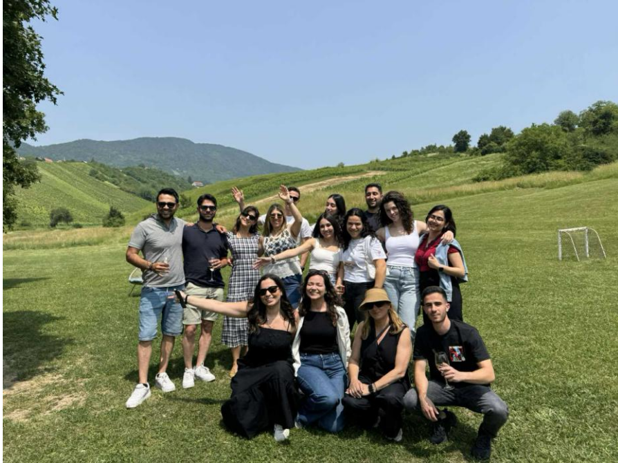
Erasmus Blended Intensive Program University of Zagreb, Croatia, 2025