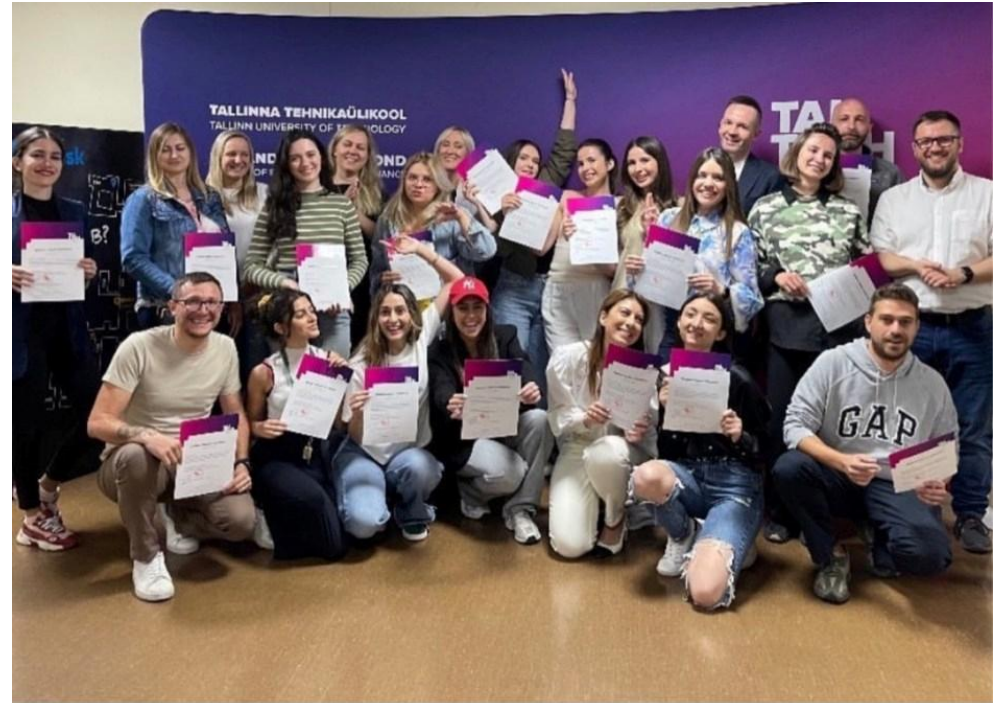
Erasmus Blended Intensive Program Tallinn University of Technology