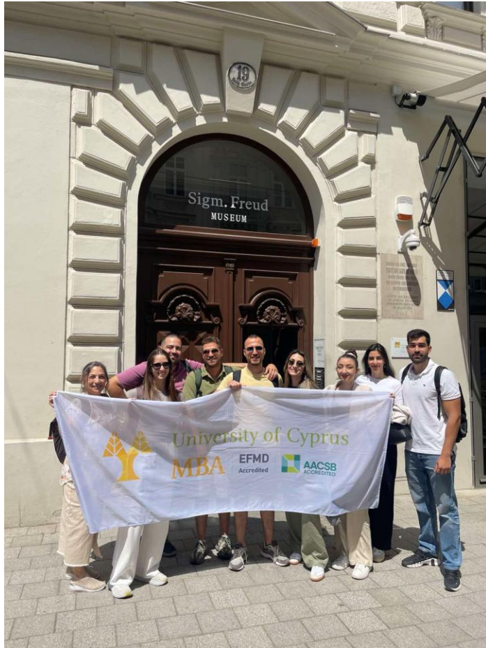
Study week in Vienna, 2024