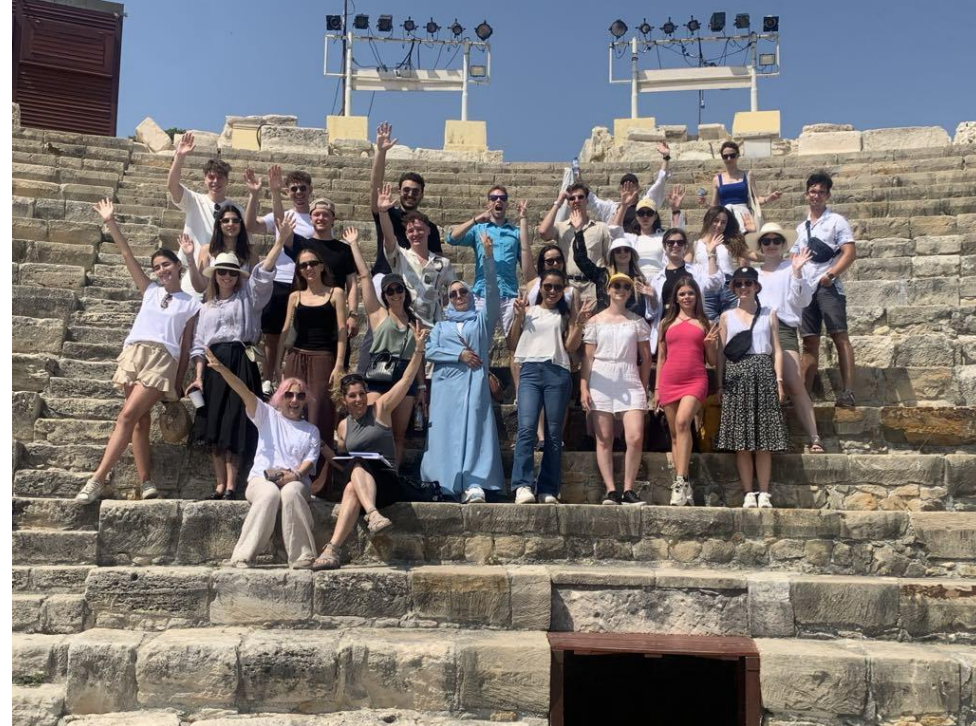
MBA 579 Ethical Considerations in Business, 2025